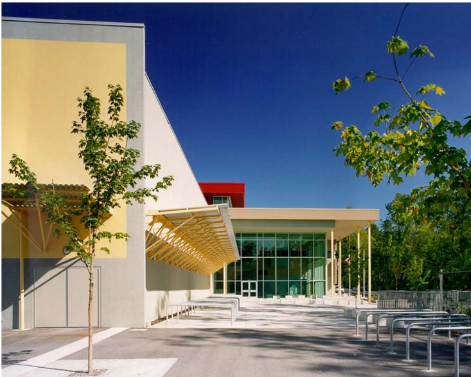
Burnaby Mountain Secondary School, an example of a project that used an integrated design approach to achieve significant green design features, including geothermal heat, natural treatment of site water, and enhancement of fish habitat and the local ecosystem.

Green Buildings BC – New Buildings Program Agencies Responsible: British Columbia Buildings Corporation Ministry of Finance and Corporate Relations