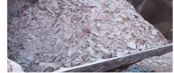
Unscreened Gypsum with paper