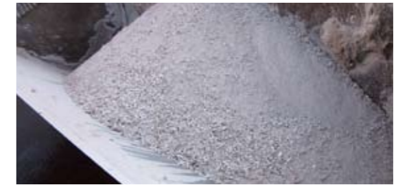
Screened Gypsum without paper